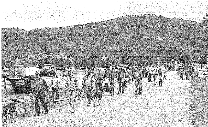
MARCH for MUTTS October 4, 2008