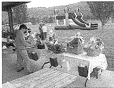
Chinese Auction & Inflatables